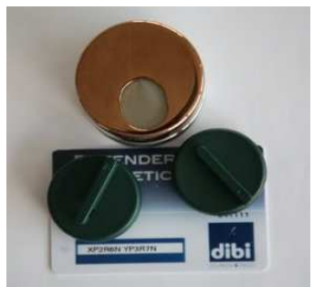
Kit defender "Key Protector" with keys and card